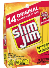
Jerky & Slim Jim's