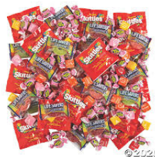
Candy for the Children