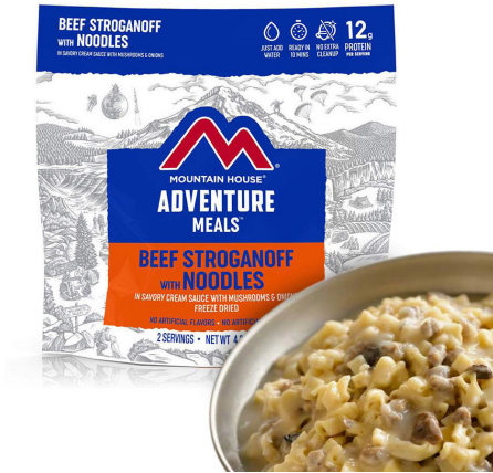
4-5 Freeze Dried Meals