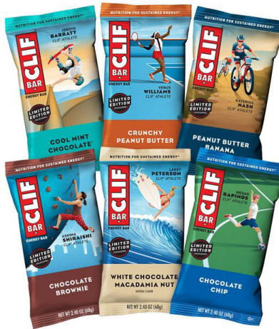
Energy Bars, Protien Bars