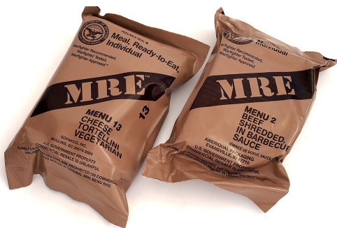
MRE's are great, but very heavy to pack.